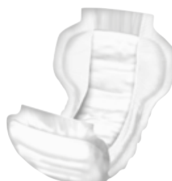
MoliCare® Premium Form