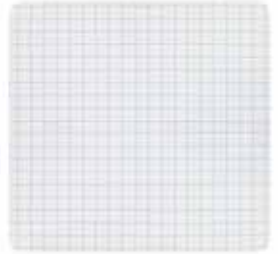
20 x 20 cm