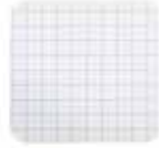
10 x 10 cm