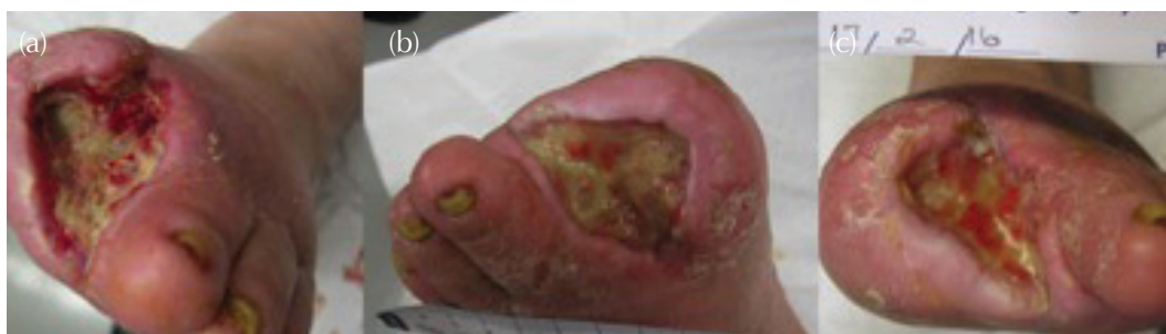
Figure 3. Case study 3 (a) Foot wound at presentation. (b) Day 14 (c) Day 28.

Autolysis is generally seen as a slow, painless method of removing devitalised tissue (Atkin and Rippon, 2016). However, debridement with HydroClean plus occurred very rapidly and in most of these cases a distinct change in the appearance of devitalised tissue was observed within 24–48 hours. For example, hard necrotic tissue became soft and