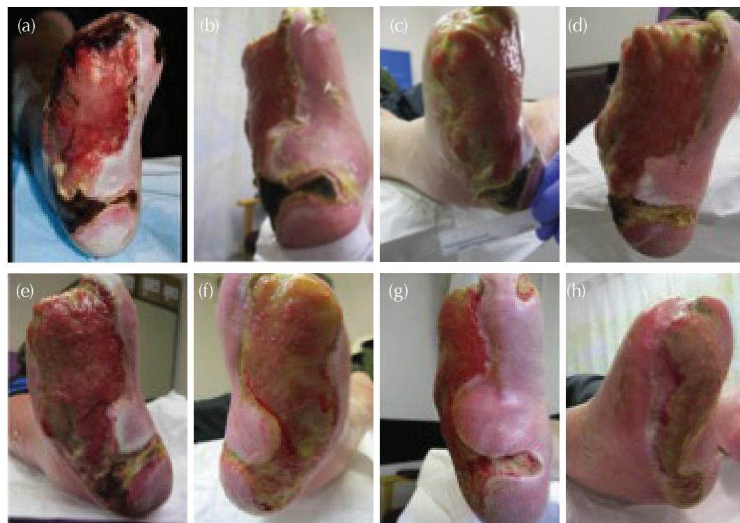
Figure 2. Case study 2 (a) Foot wound at presentation. (b) At day 7, some sharp debridement was possible. (c) At day 14, the area around the plantar heel was suitable for debridement. (d) At day 14, after surgical debridement. (e) Day 21. (f) Day 56. (g) Day 70 (h) Day 98.

Mr Y was referred via Trafford Diabetes team due to severe, and rapid deterioration of his neuro-ischaemic wounds which were potentially limb threatening. He was seen by the vascular consultant in the author's MDT clinic and referred immediately for surgical debridement and vascular intervention.