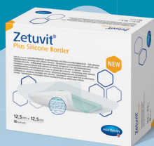
Zetuvit® Plus Silicone Border