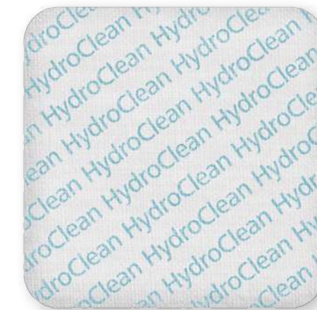
7.5 x 7.5cm