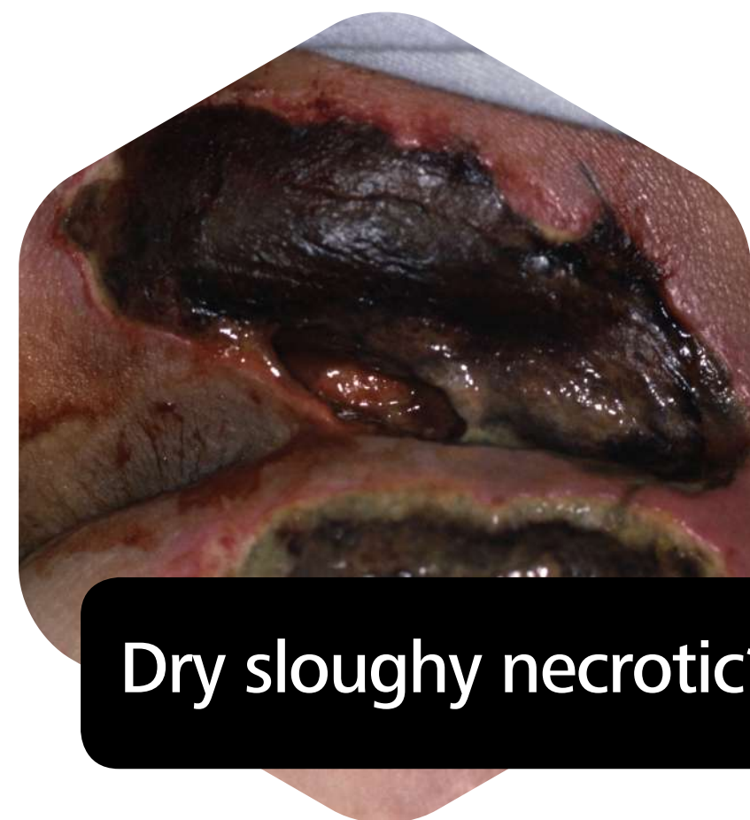
Dry sloughy necrotic*