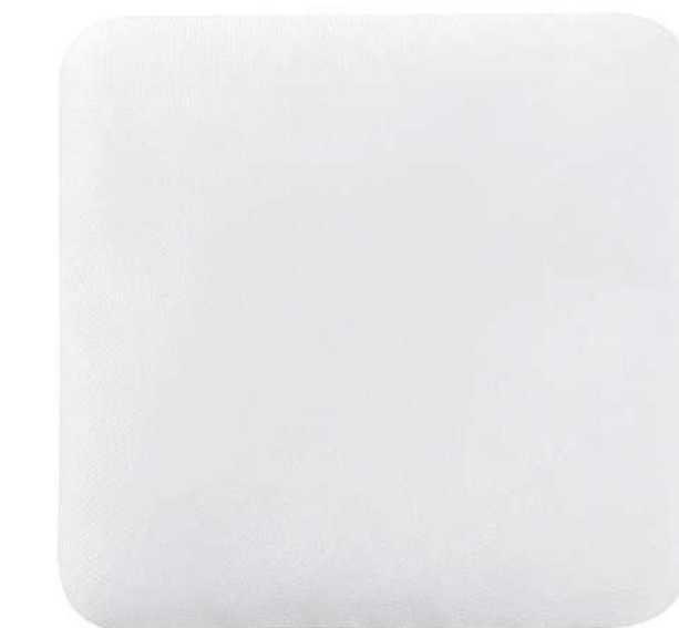
7.5 x 7.5cm