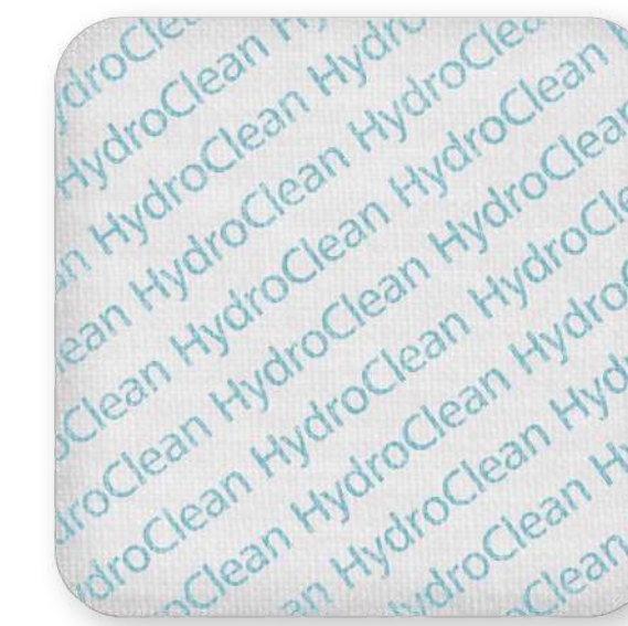
10 x 10cm