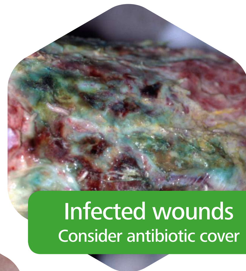
Infected wounds Consider antibiotic cover